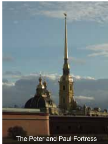
The Peter and Paul Fortress

as we found ourselves in the starting point of our tour – the Palace Square which is the heart of this magnificent city where you can physically sense the pulse of its grandiose history.