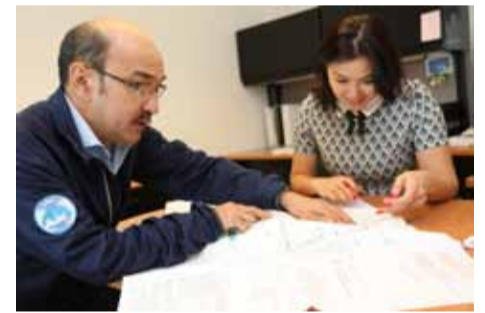
The white sail of creativity