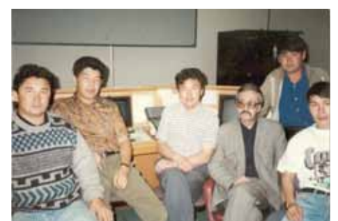
The expanse we refer as life