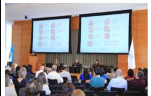
Breast Cancer Awareness