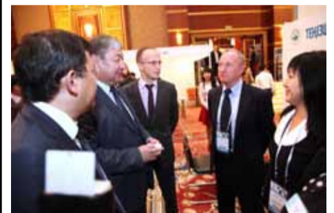
Optimism of cooperation