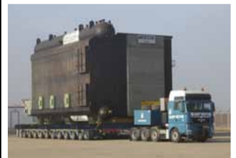
330-ton Cargo Safely Transported through Atyrau