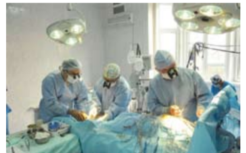
TCO's "Hearty" Project