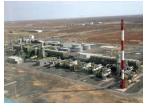
The Result of Teamwork