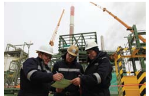
Full Steam Ahead