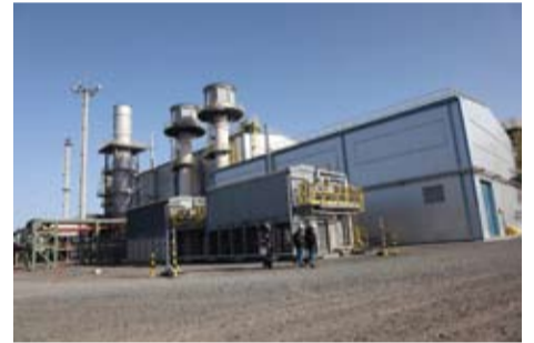
SGI Runs Like Clockwork