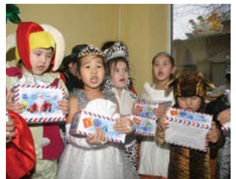
New Year Roundelay