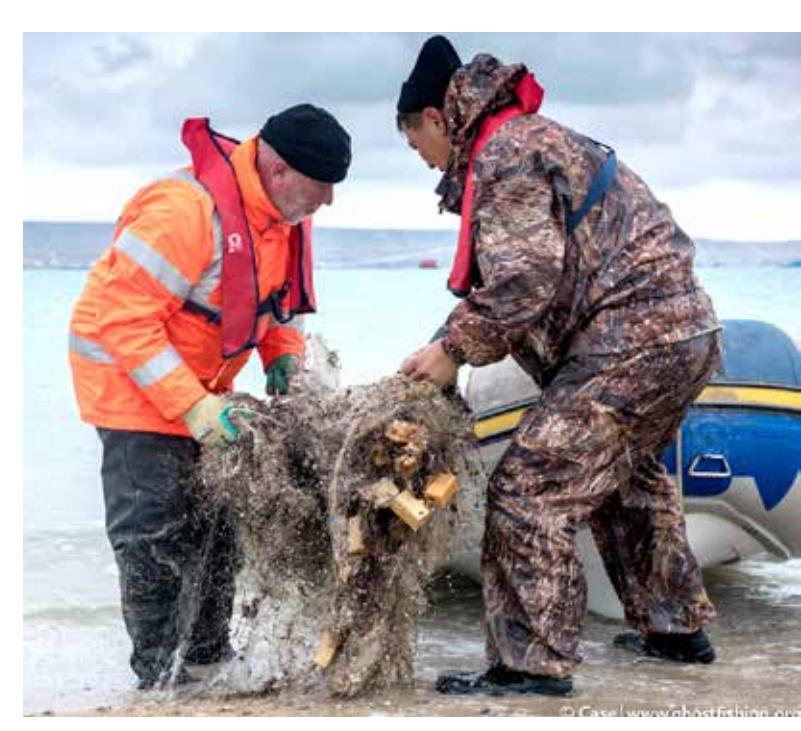
* Removing unused nets from the Caspian Sea