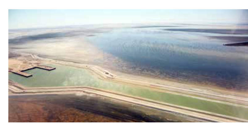
* The Cargo Transportation Route (CaTRo): Construction of the marine channel and control fill of the turning basin completed in August 2017

TCO Management is also actively developing data science skillsets among Kazakhstani employees through mentorship and on-the-job training assignments lasting nine months or more.